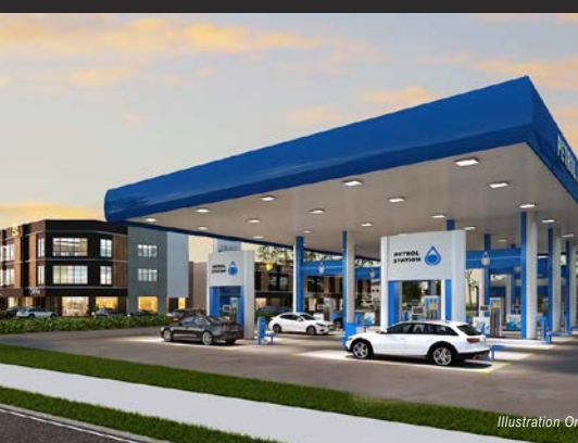
In close proximity to the petrol station which provides greater convenience